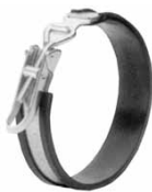
Safety clamp preventing coupling from disconnection