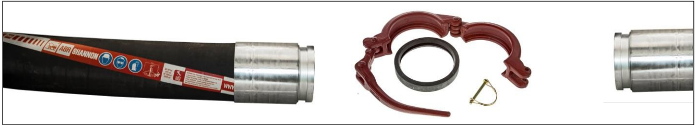
Basic dimensions of groove couplings for concrete for SHANNON hoses