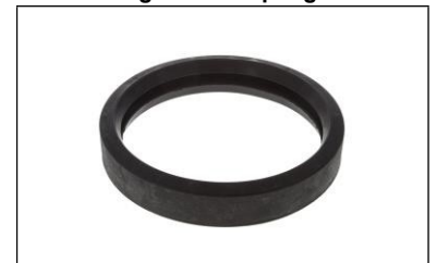
Gasket for groove couplings

Gasket for groove coupling clamp. Material: SBR rubber