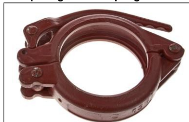
Clamp for groove couplings

Groove coupling clamp without gasket and pin. Material: carbon steel. Working pressure 85 bar.