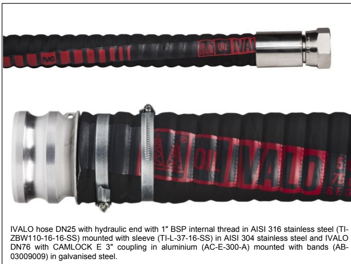
IVALO hose DN25 with hydraulic end with 1" BSP internal thread in AISI 316 stainless steel (TI-ZBW110-16-16-SS) mounted with sleeve (TI-L-37-16-SS) in AISI 304 stainless steel and IVALO DN76 with CAMLOCK E 3" coupling in aluminium (AC-E-300-A) mounted with bands (AB-03009009) in galvanised steel.

Notes: indices highlighted in colour - most commonly used; * - approximate values due to corrugated hose construction