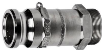
CAMLOCK connector connector butt-welded to a BSP male threaded end (end index: TK-WGZ-050-200).