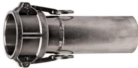
CAMLOCK connector socket butt-welded to seamless EN 10216-2 pipe (pipe index: MPR-RBSZ-060X2.9- SS321) in AISI 321 steel.