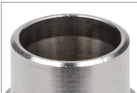
Bevel Y 30°