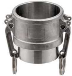
CAMLOCK connector socket with butt welding end