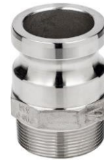
stainless steel AISI 316