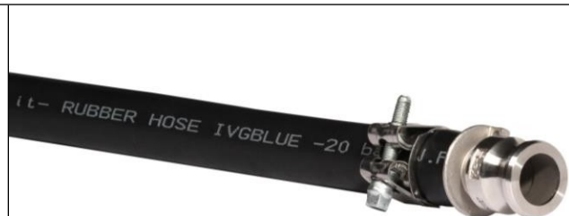
CAMLOCK type E 3/4" connector plug in AISI stainless steel 316 mounted to the BLUE 20 BAR DN19 hose (IV-BLUE20-19) using the SUPRA HEAVY DUTY screw clamp (AB-03013075) in AISI 316 steel.