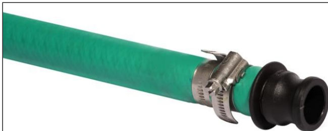
CAMLOCK type E 3/4" polypropylene connector mounted to VACUPRESS CHEM DN19 hose (ME-VACUPRCH-019) using ASFA-L 9 mm worm bands (AB-03015783) in AISI 316 steel.