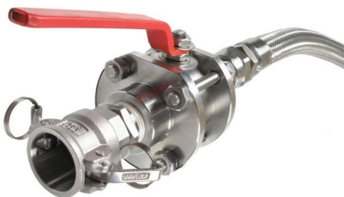
CAMLOCK coupling socket type DU 1" in AISI 316 stainless steel mounted to a flanged ball valve using a DN-type adaptor (sealing with a flat gasket). All connected to B-FLEX steel hose DN25.

* - available with E-CTFE lining, example index: AC-DU-100-SSE