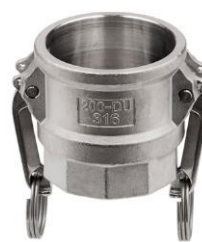
stainless steel AISI 316 (PTFE flat seal)