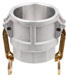
Aluminium (polyurethane flat seal)