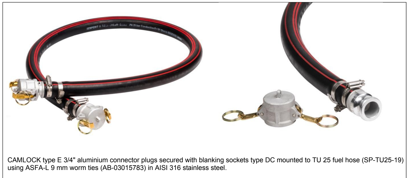
CAMLOCK type E 3/4" aluminium connector plugs secured with blanking sockets type DC mounted to TU 25 fuel hose (SP-TU25-19) using ASFA-L 9 mm worm ties (AB-03015783) in AISI 316 stainless steel.

Note: The chain for the cap is a separate product item.