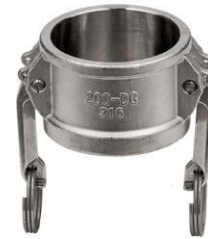
stainless steel AISI 316