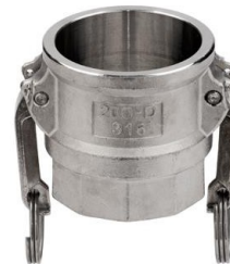
stainless steel AISI 316