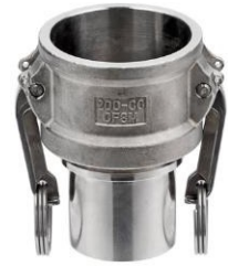
stainless steel AISI 316