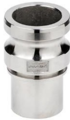
stainless steel AISI 316