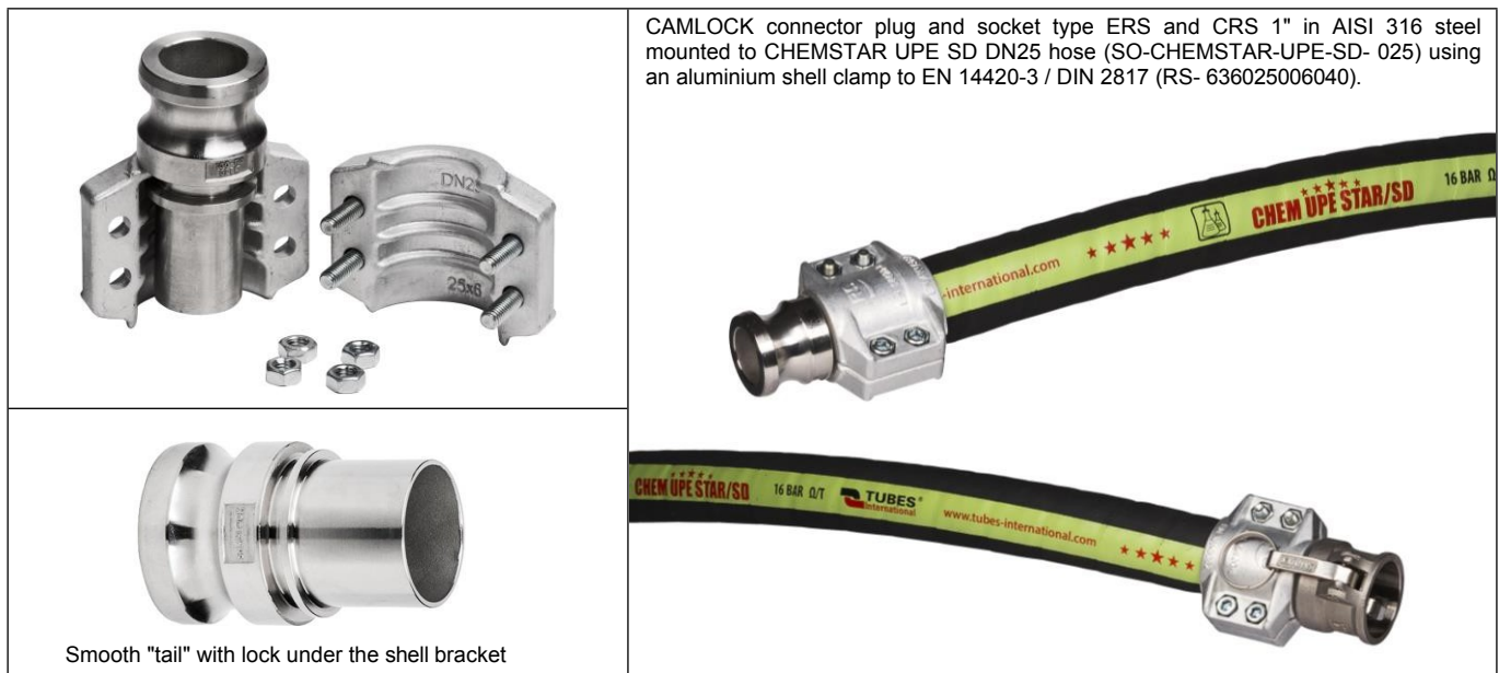
CAMLOCK connector plug and socket type ERS and CRS 1" in AISI 316 steel mounted to CHEMSTAR UPE SD DN25 hose (SO-CHEMSTAR-UPE-SD- 025) using an aluminium shell clamp to EN 14420-3 / DIN 2817 (RS- 636025006040).

Note: The inside diameter of the hose to which the nozzle will be fitted should not deviate too much from the table above. This applies particularly to hoses made of harder plastics or with a hard polymer spout (e.g. UPE), where too much clearance between the nozzle and the hose can cause leakage.