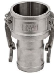
stainless steel AISI 316