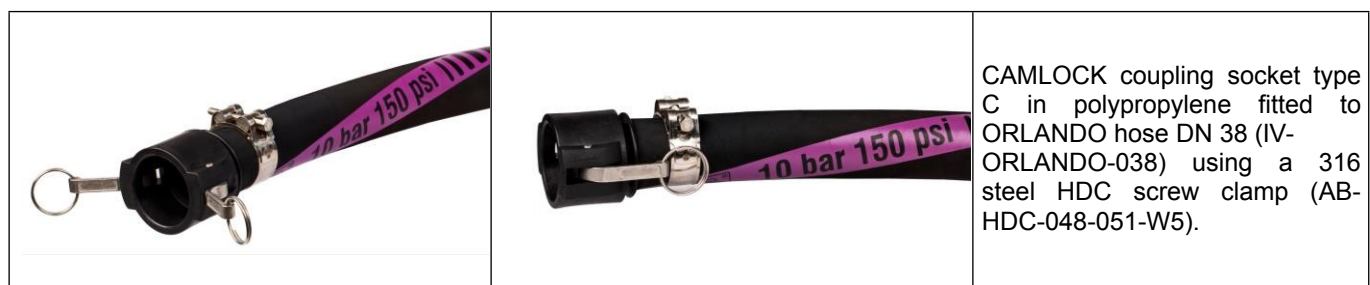
CAMLOCK coupling socket type C in polypropylene fitted to ORLANDO hose DN 38 (IV-ORLANDO-038) using a 316 steel HDC screw clamp (AB-HDC-048-051-W5).