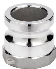
Aluminium (polyurethane flat seal)