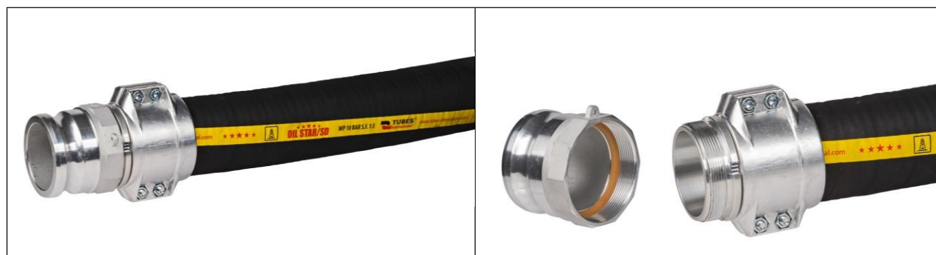
CAMLOCK coupling plug type AU 3" in aluminium mounted to OIL STAR SD hose (SO-OILSTAR-SD-076) by means of an aluminium coupling with protective collar for hose with male thread (butt seal) type VSL (GD-VSLB-080-075-AL) bolted with a shell clip in accordance with EN 14420-3 (TI-SC-075-060-AL).

* - available with E-CTFE lining, example index: AC-AU-100-SSE