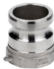
stainless steel AISI 316 (PTFE flat seal)