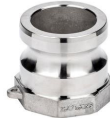
stainless steel AISI 316